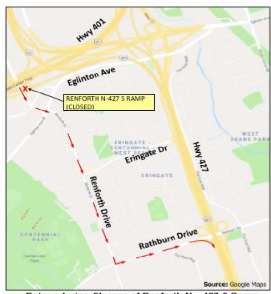
Detour during Closure of Renforth N – 427 S Ramp SB Renforth to EB Rathburn Drive to Hwy 427