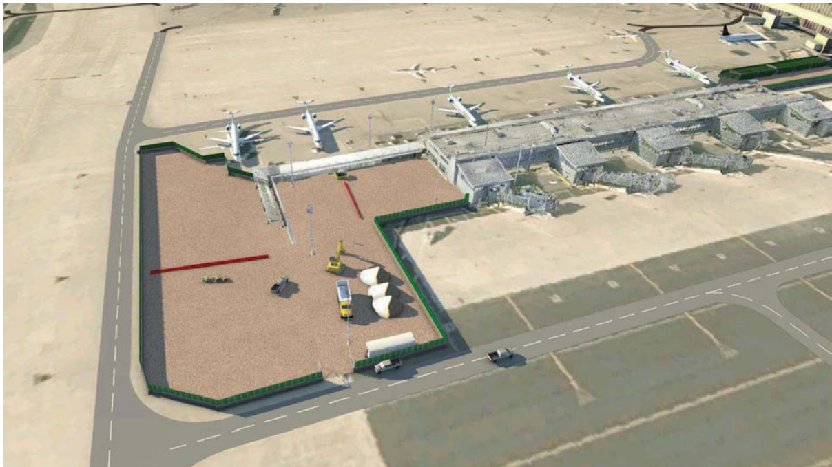
Figure 2 – Contractor Work Area Layout (South)