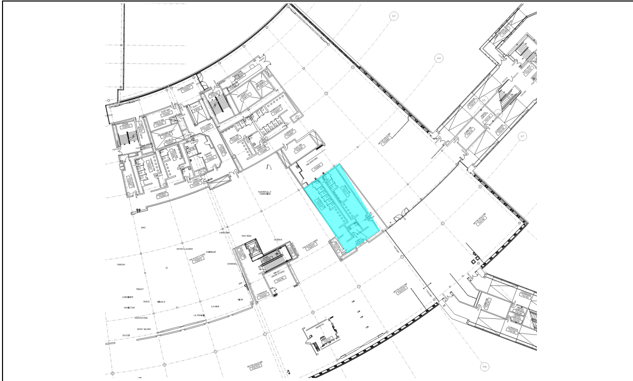
Figure 3: FG2107/FG2111 (Lounge E78/E79)