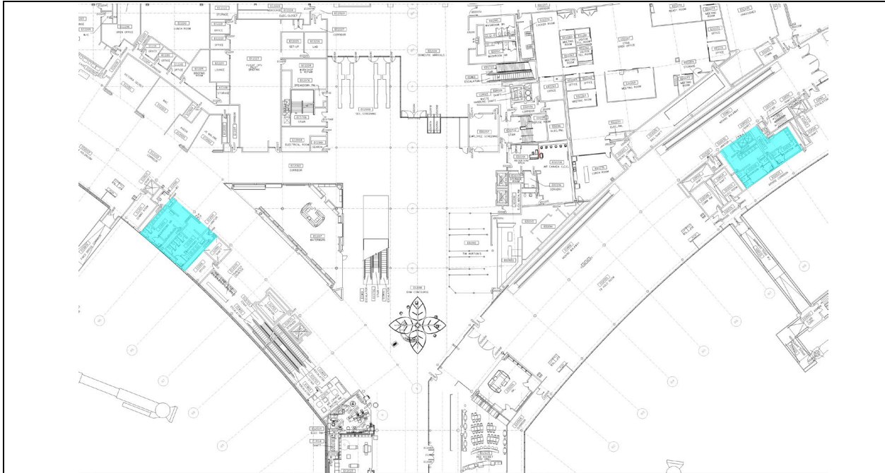
Figure 1: EC2012/EC2013 (Lounge D20), ED2030/ED2031 (Lounge D51/F51)