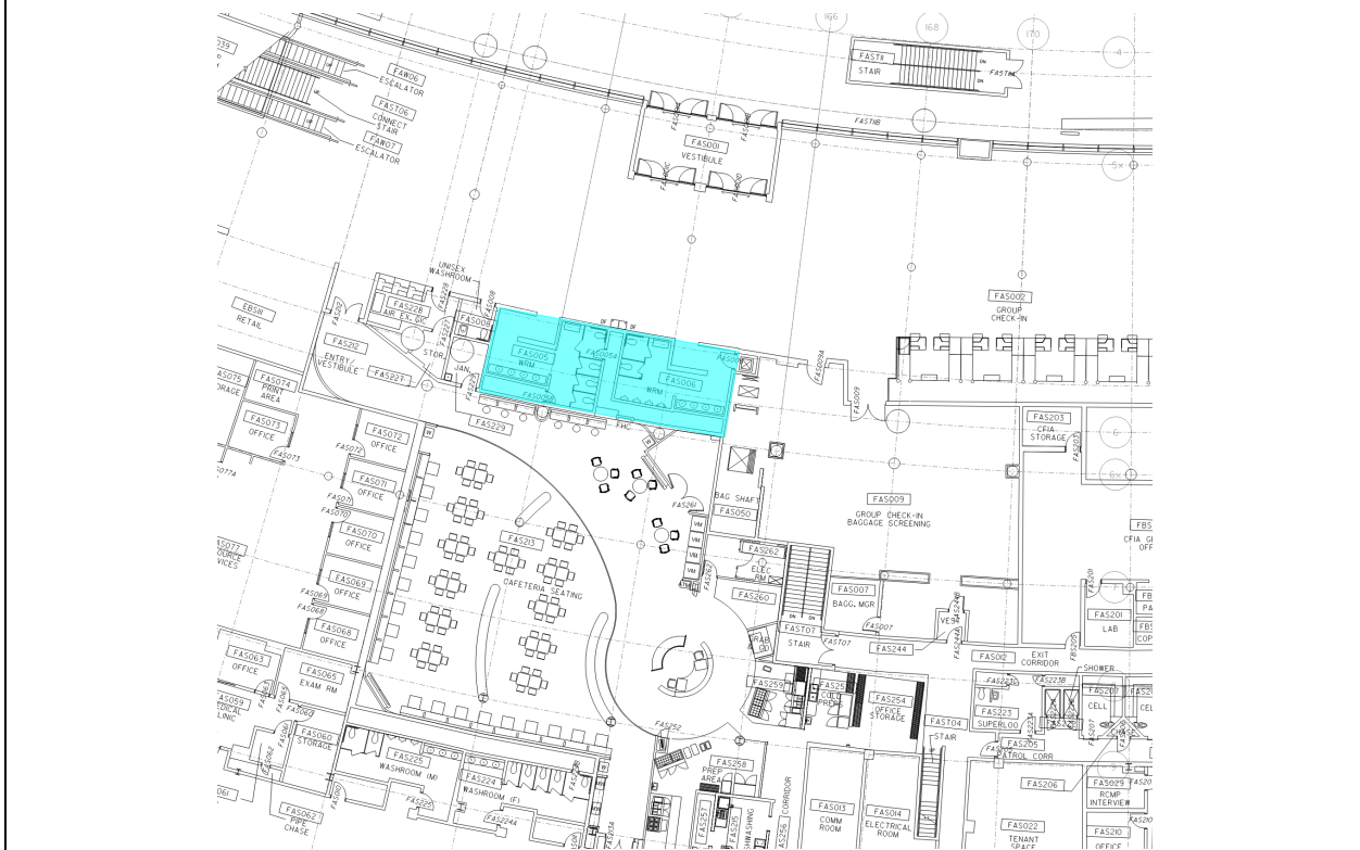
Figure 4: FAS005/FAS006 (outside employee zone)