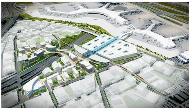
Preliminary concept for regional transit centre

Last year, the Neptis Foundation, a non-profit, non-partisan research group, published a study that concluded that the Airport Employment Zone (AEZ) is home to the second largest concentration of employment in Canada, after downtown Toronto. The report explains that due to poor transit connections there are more than 1 million daily car trips to and from the area, with 94 per cent of employees commuting to their jobs by car.