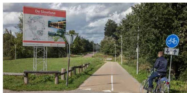
The "Slow Lane" in Eindhoven provides a continuous bike connection between employment areas year round

The RTC could help to create new cycling and pedestrian linkages in the AEZ, and transform some of the car-oriented environment with more sustainable and human-scaled urban design. The "Slow Lane" project in Eindhoven, Netherlands offers a potential model. Across four municipalities the Slow Lane passes through industrial areas, the high-tech business centre, Eindhoven Airport, university campuses, neighbourhoods, and even nature reserves, delivering the fastest and most environmentally sustainable surface link for employees in the region. The roads and green system in the AEZ could deliver similar connectivity for cyclists, pedestrians and potentially emerging micro-mobility modes, while also improving the quality of the public realm.