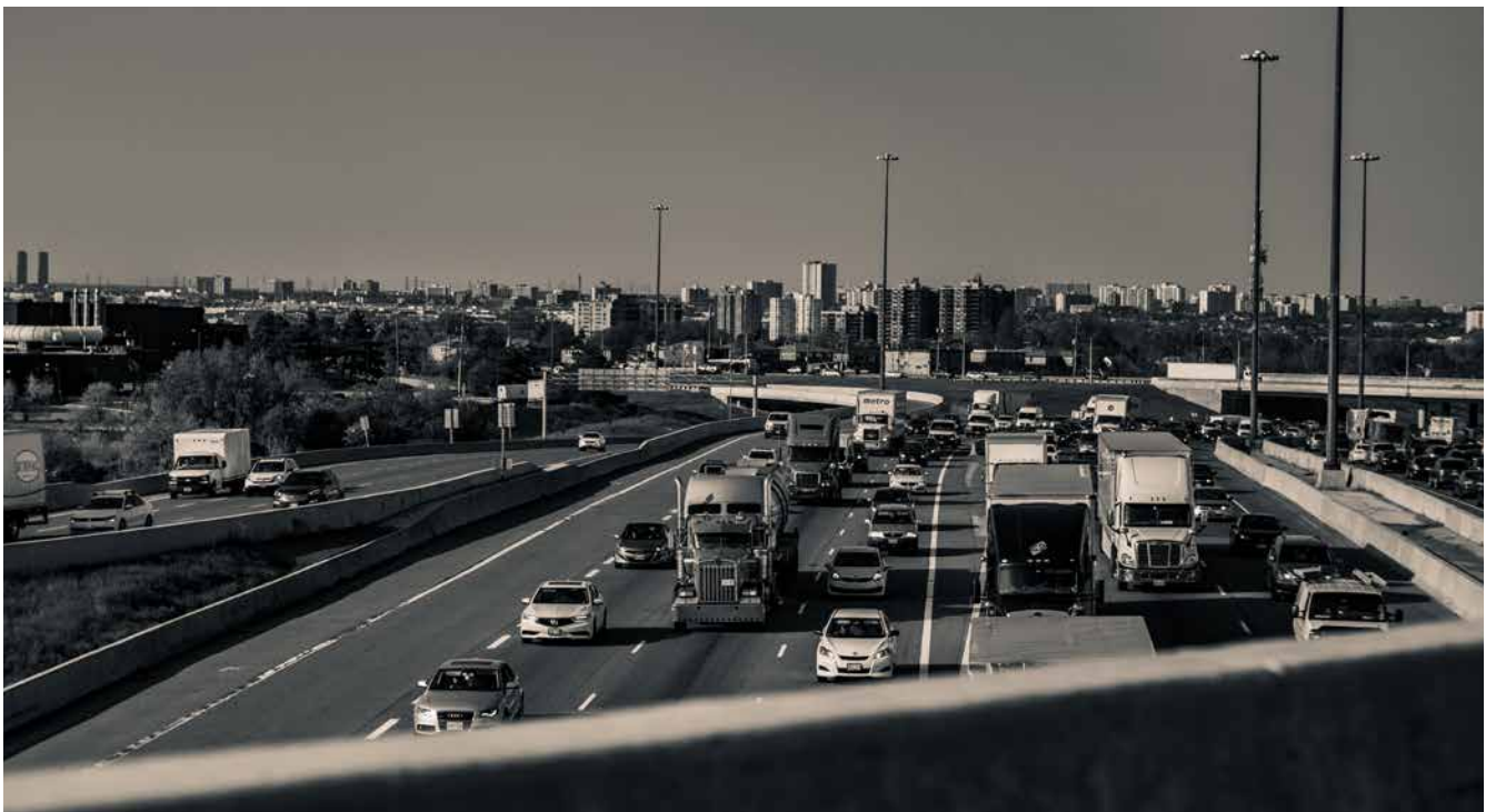
Traffic on Highway 401.