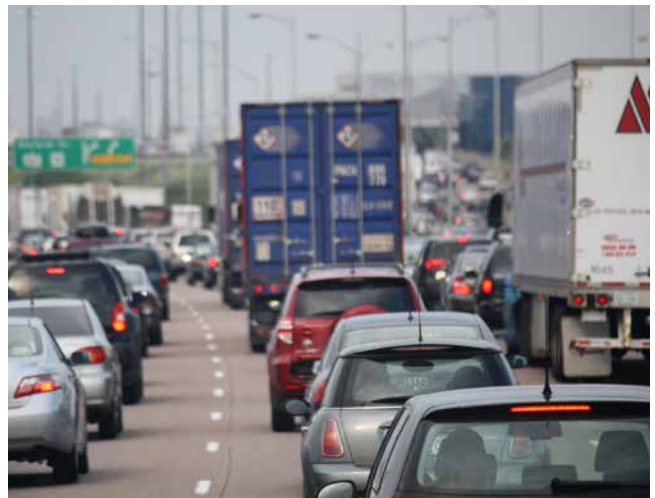
The GTA has the 6 th worst commute among global cities

It's clear that the status quo is untenable. The GGH needs regional ground connectivity strategies.