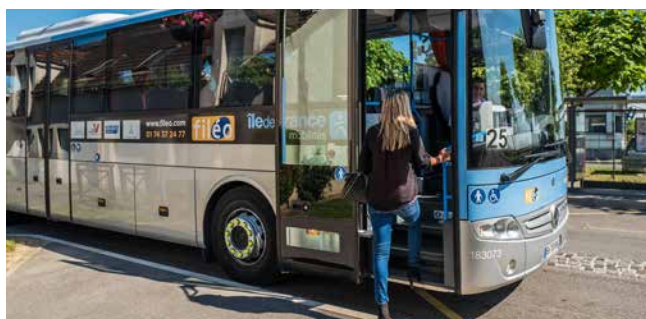
The Filéo bus system provides on-demand, all-day bus service for employees at Charles de Gaulle Airport

The RTC would provide a hub in the centre of the AEZ at an existing major employment destination, pulling together several municipal services and enabling better coordination among transit providers. This could be combined with additional local services that further extend into the AEZ.