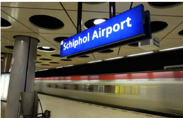
Thalys train leaving Schiphol Airport station.