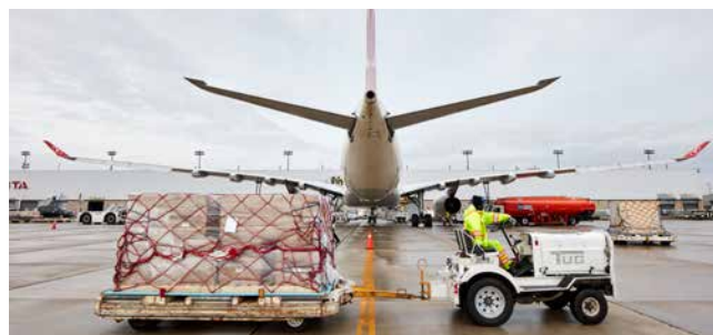
Pearson handles almost half of Canada's air cargo

airport. However, with no strong high-order transit link to the AEZ, many commuters are stranded with few options. Many AEZ workers from York and Durham rely on personal vehicles and the 407 tolled highway or multiple transit connections that also face standstill traffic on Highway 427.