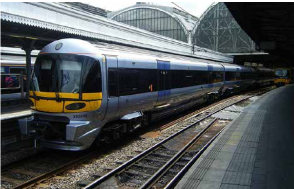
A Heathrow Express train.