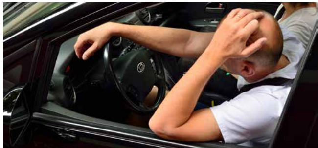
Congestion affects the health and wellbeing of commuters

services because there is not coordination across municipal boundaries. These are steep penalties in time and cost for people with limited incomes. Stakeholders across the region want investments in transit that match the inter-municipal needs of all travellers, and not just those who can afford toll highways or whose companies can provide private shuttles.