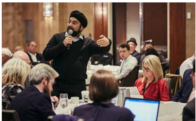
Stakeholders discussing last-mile solutions as part of a GTAA roundtable on October 3, 2019

GO, there simply isn't efficient last-mile connectivity to get them the rest of the way. Walking and cycling is almost completely out of the question in an area so completely dedicated to auto travel.