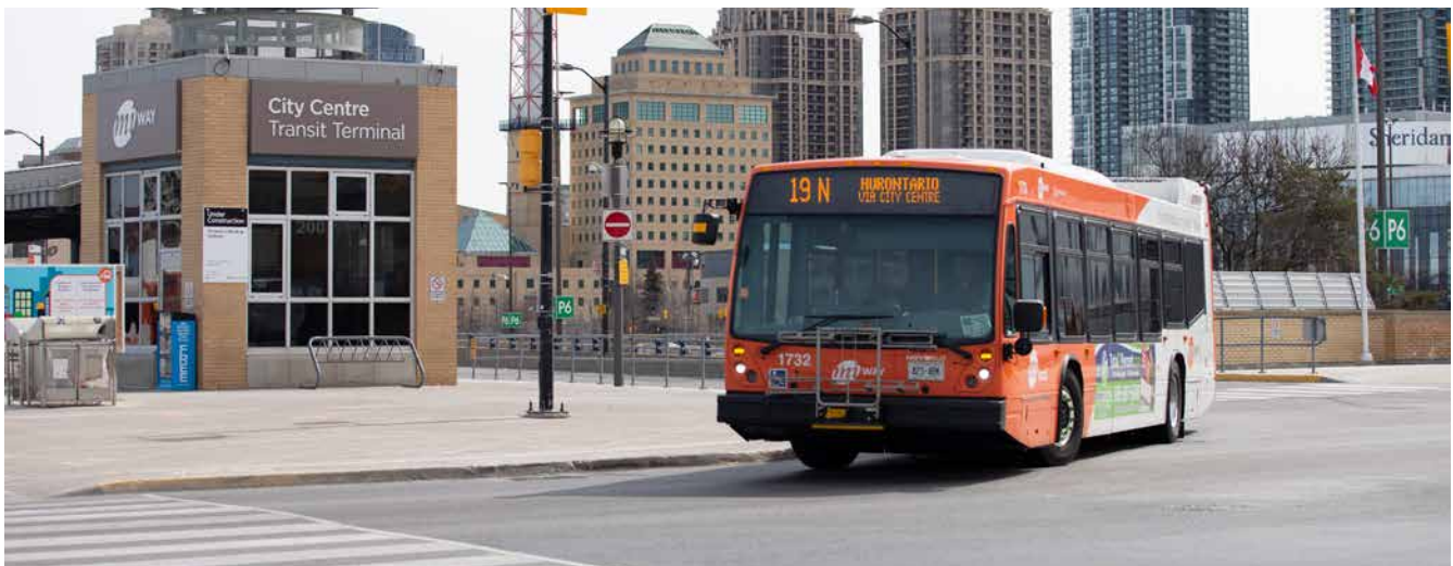
A MiWay bus departing the City Centre Transit Terminal in downtown Mississauga