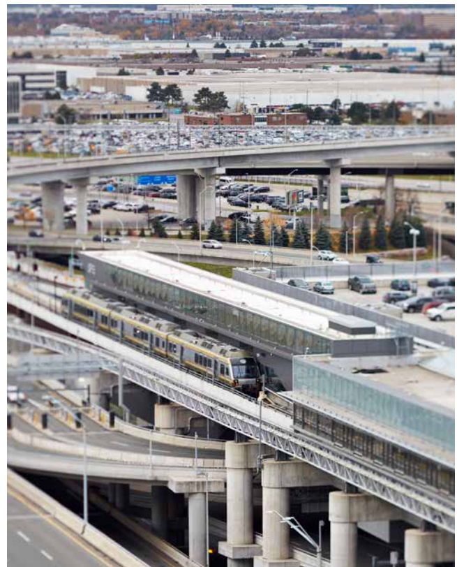
The UP Express train at Pearson airport

Roundtable participants included municipal administrators and planning, transportation and economic development leaders; representatives from the Southern Ontario Airport Network (SOAN); representatives from post-secondary schools; senior staff from transit agencies; stakeholders from regional employers, and other private sector representatives, including from the goods movement industry.