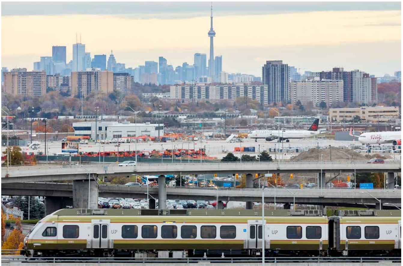
A UP Express train with Pearson and the Toronto skyline in the background