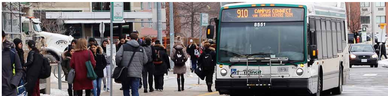
Local bus service to UOIT.

The complexity of joint-institution programs and multi-campus schools is made harder still by transit connectivity in the region. Wilfrid Laurier University maintains campus buildings in Waterloo, Brantford, Milton and Toronto, needing to maintain connectivity between all of them for a free-flow of students. When it comes time for work placements and co-op terms, future job development could be at risk because of the same lacking connections.