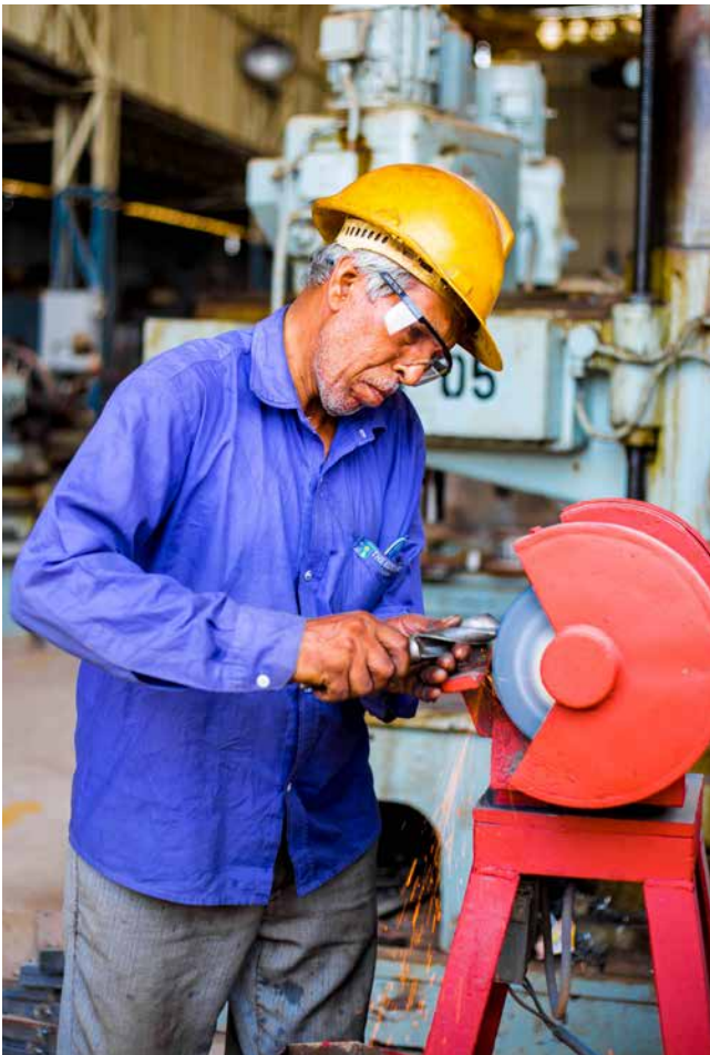
Businesses want better ground connectivity to boost talent attraction and productivity

The demand for better regional ground connectivity is strong, and in its absence, the workforce is relying on personal automobiles to reach the economic zones that offer jobs and opportunity. Poor transit on these heavily trafficked inter-zone routes is presenting serious challenges to the economic growth and prosperity of the regional zones.