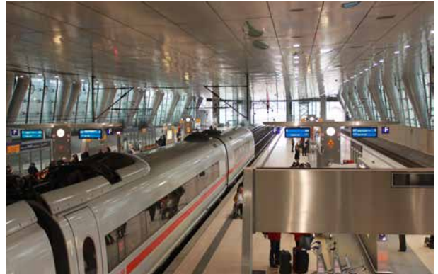
The Frankfurt Airport train station.

These examples of combining global air connectivity with wide-reaching regional transit systems illustrate a possible future for our region, with the RTC helping to make it possible. The RTC also aligns with the priorities of regional stakeholders, which are summarized in the next section of this paper.