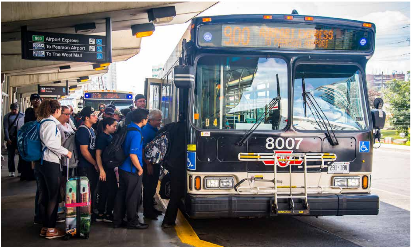
Passengers boarding the TTC 900 Airport Express bus to Pearson