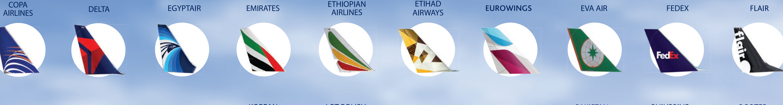
AIR CANADA AER LINGUS AEROMEXICO AIR CANADA AIR FRANCE AIR NORTH AIR TRANSAT AIR INDIA ROUGE CANADA JETLINES AZORES AIRLINES BIMAN BRITISH CANADIAN CARIBBEAN CATHAY CHINA BANGLADESH NORTH AIRWAYS AIRLINES PACIFIC EASTERN COPA AIRLINES ETHIOPIAN ETIHAD EGYPTAIR EUROWINGS EMIRATES EVA AIR DELTA AIRLINES AIRWAYS